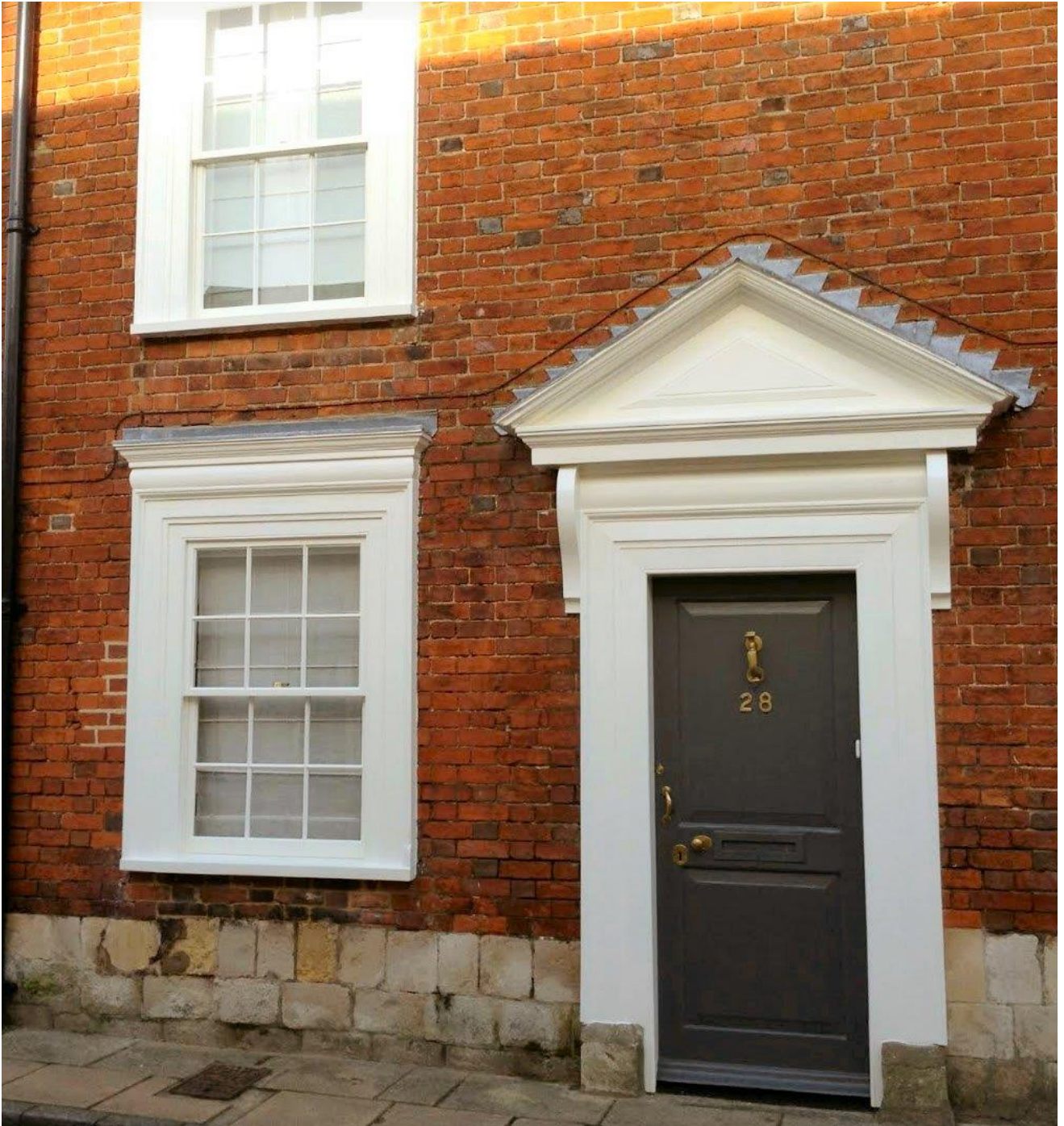
28 Canon Street – 2