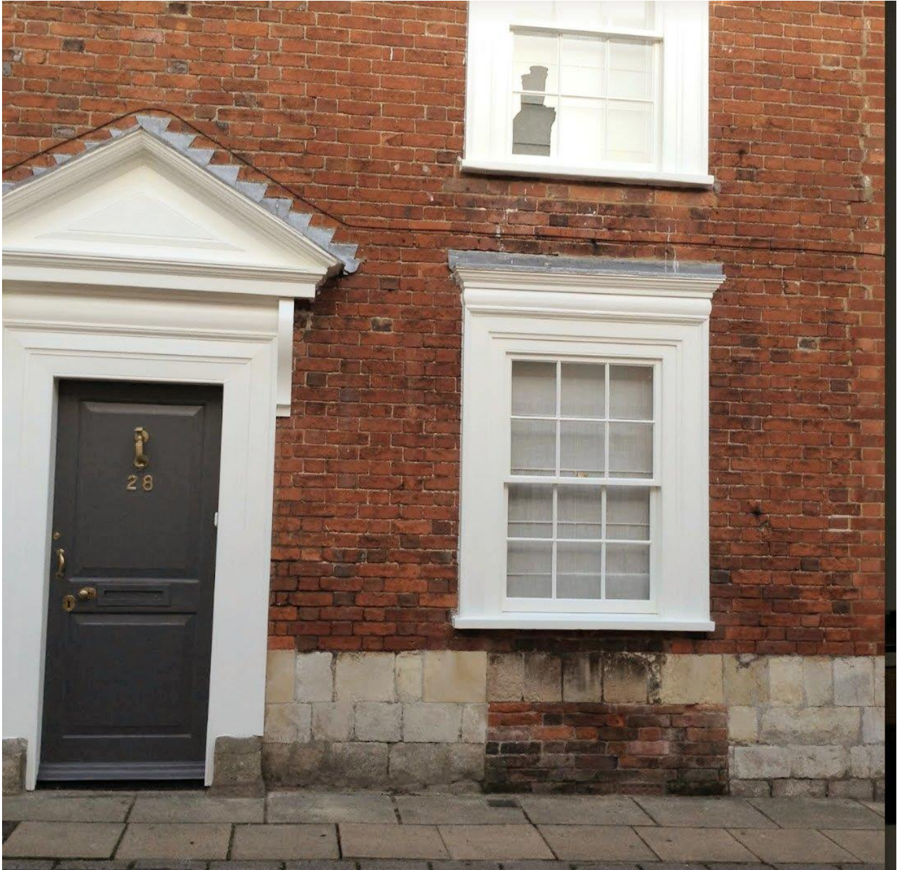
28 Canon Street - 1