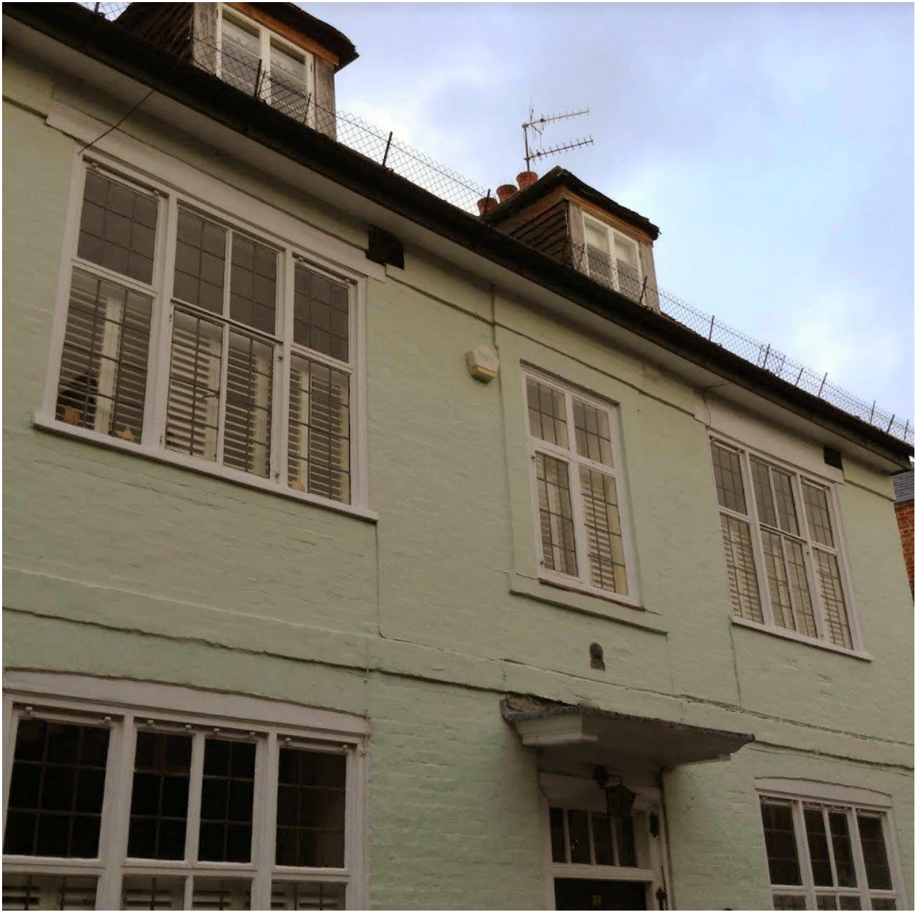
56 Canon Street - 2